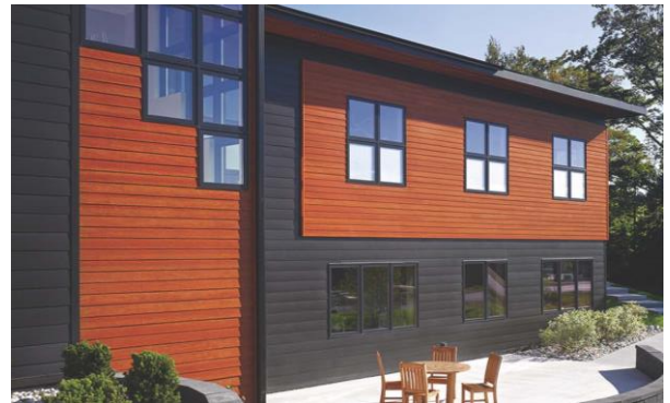
(Above) this is an example of the proposed material pallet for the proposed new structure. (Below) an example of the proposed cedar fence

Impacts of Proposal (Design and Compatibility): The proposed modifications to the existing structure will not significantly alter its design and compatibility with the neighborhood. The proposed front porch will be reconstructed to take up less of a footprint and the appearance will be enhanced. The vinyl siding will be removed and replaced with cedar clapboards or fiber cement siding. The existing penthouse will be slightly enlarged.